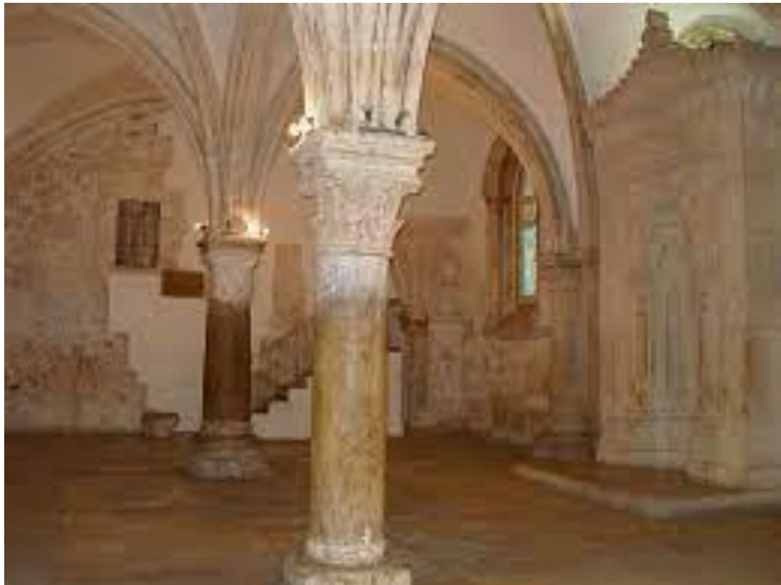
The Upper Room